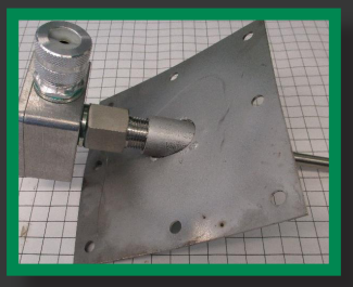
Column temperature sensor in mounting plate